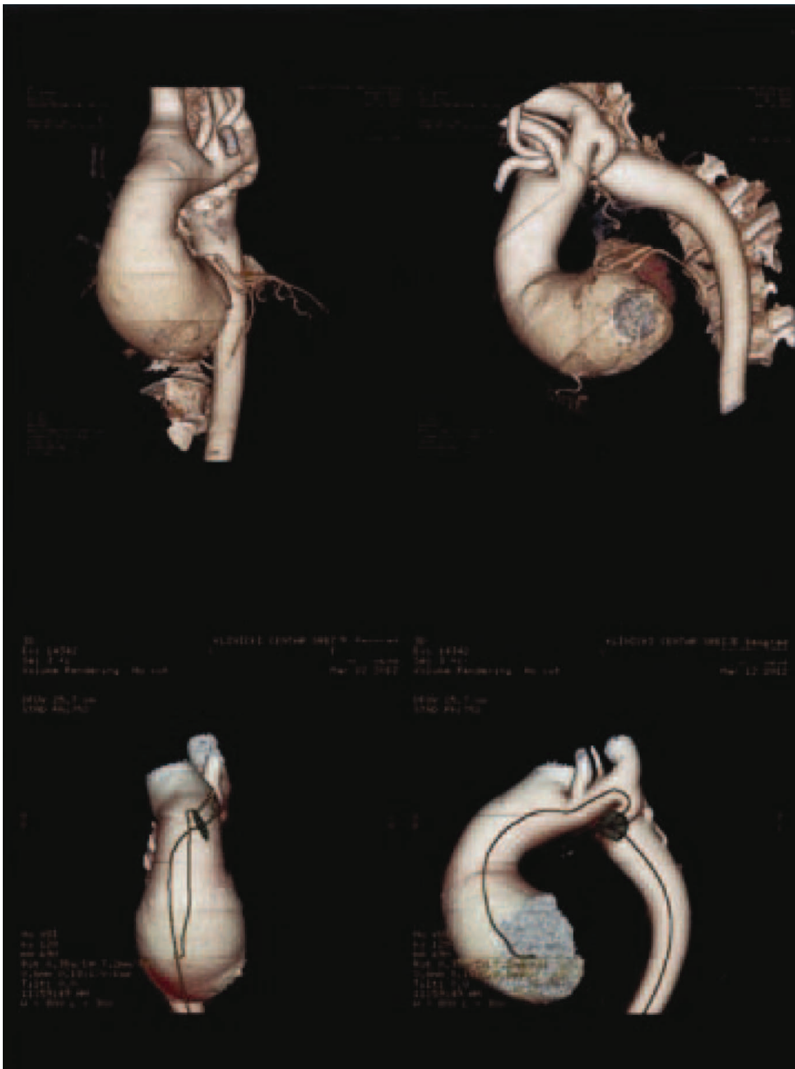
Fig. 1 – Presurgical multislice computed tomography showing aneurysmatic dilatation of aortic root and ascending aorta. A spindle like narrowing of aorta after the branching of left subclavian artery with poststenotic dilatation of the descending aorta. Visible mechanical aortic valve.